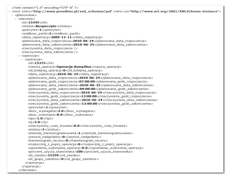
Fig. 3. Exemplary part of XML Schema as ProEDIMS, KbRS and SWZ interface

Example of a part of XML Schema containing definition of the XML document structure was shown on Figure 3.